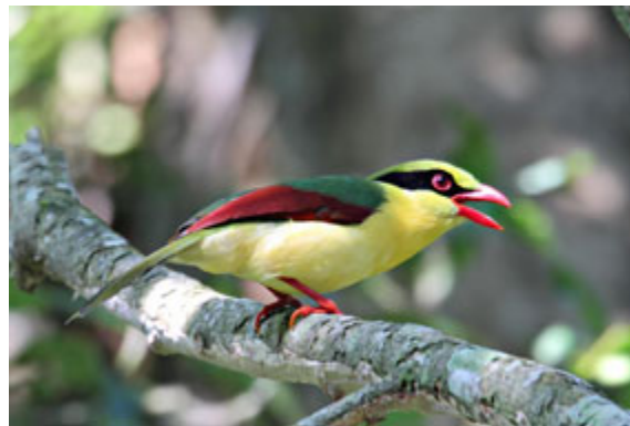
Indochinese Green Magpie

An early morning visit to Deo Suoi Lanh to look for other exciting possibilities that could include Blue Pitta, Indochinese Green Magpie, Spotted Forktail and Green Cochoa, before continuing along Highway 20 to the cooler climes of Dalat. In the afternoon make the first of several visits to the Ta Nung Valley, a small but bird-filled area of remnant evergreen forest 10 km from Dalat. This is the most accessible site for the rare and endemic Grey-crowned Crocias and Orange-breasted Laughingthrush. In addition the very distinct local subspecies of Blue-winged Siva, Black-headed Sibia and Black-throated Sunbird are common here. Overnight at Dalat.